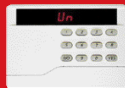
Gardtec 500 Traditional Keypad