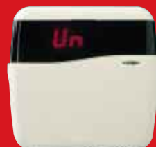
Gardtec Contour LED RKP