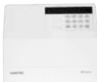
Gardtec 581 Control Panel

The aesthetics of the Gardtec 500 Series are designed to blend in with almost all décor and surroundings and now with the compatibility with 3 additional attractive keypad designs make this the ideal security partner.