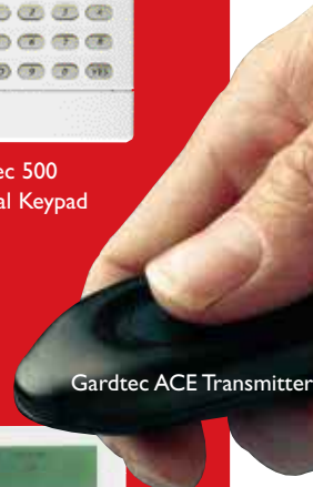
Gardtec ACE Transmitter