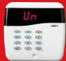
Gardtec Profile RKP