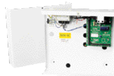
Gardtec 582 Control Panel