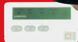
Gardtec ACE Receiver